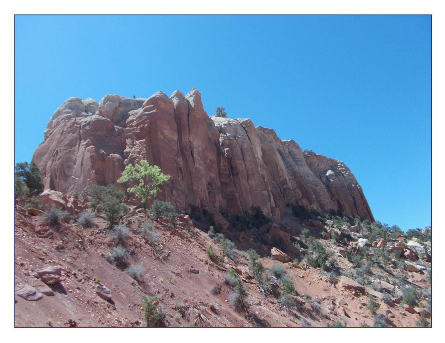
At the entrance of Box Canyon, Tom and I found this young cottonwood tree hoisting sentinel on a red hill. Its emerald leaves shimmering in the desert heat. When the wind blew, its leaves vibrated blissfully like thousands of silver coins.