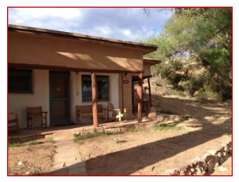
My cabin has no lock, but I felt safe the whole time

I stayed in a small cottage across from Tom and HY's. Their cabin had a spacious living room and two private rooms. The place could easily house six people. In front of our cabins, there were breathtaking vistas of colorful sandstone cliffs, cottonwoods, and distant mountains. Once we settled, Tom and I headed out to explore the Ranch while HY preferred to stay behind.