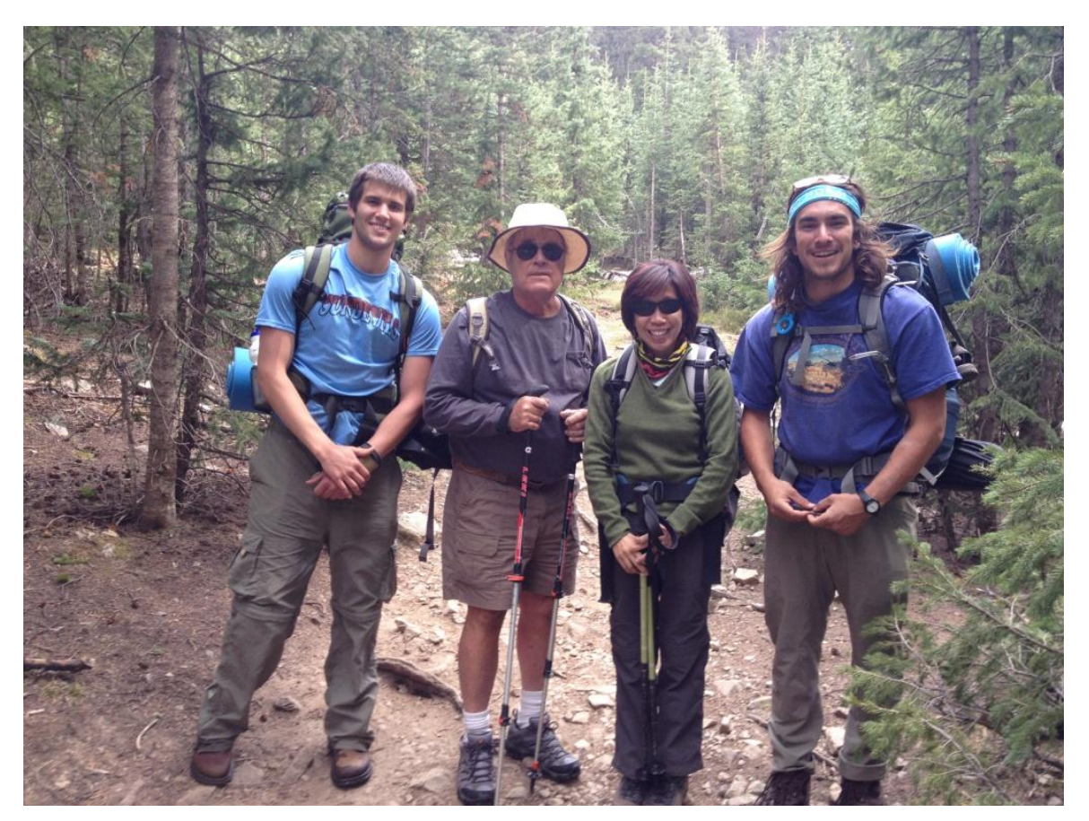
The biggest reward for the hike, met three handsome guys on the trail, I mean HANDSOME

When three of us reunite at the parking lot, our spirit is still high. We have just climbed the highest mountain in New Mexico! We jump into our vehicle, laugh and chat and continue to head to the unknown. Stay tuned for our next adventure!