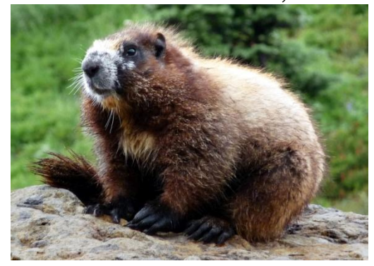
Do you see the resemblance between the Marmot and Tom? ☺

We probably have this conversation more than