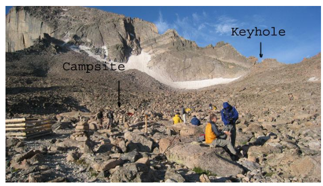
The Boulderfield Campsite

At this point, I knew that I had almost finished_the first six miles and was getting closer to the peak, but didn't realize that the real challenges had just started.