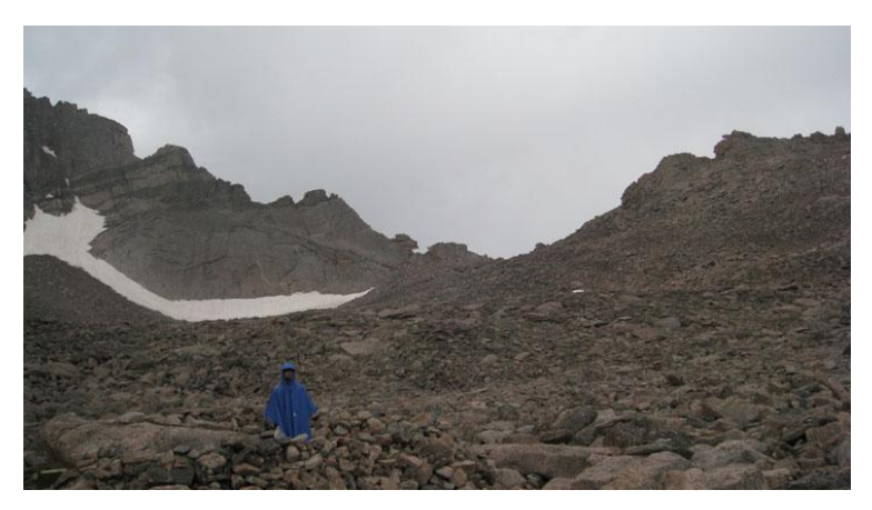
My last picture of Keyhole as well as my last photo of the hike

My first goal was getting back to the Keyhole, then passing the Boulderfield. I knew after that, I would only have to deal with fatigue without any risk to my life. However, the intervals felt like forever. I felt my energy level was almost zero. I picked up my hiking poles at the Keyhole. When we reached the Boulderfield, the boulders were all wet from the rain and hail, which increased the danger. Our backpackers picked up their backpacks at the