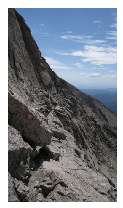
Crossing the Narrows

We were entering the Narrows. As you can imagine from its name, the Narrows is a ledge on the side of the mountain that varies from between one to a few feet wide. It presents the most exposure along the entire trail. This part is notorious for fatal accidents. Just glancing from a few feet away, I thought it was impossible to cross it, as I could barely see a path, only people moving around gingerly on the wall of the mountain. I didn't know where they were setting their feet. However, if I focused only on my next step, I figured that I could always find a spot to move forward. It was the exposure which was the hardest part to deal with, harder than actually moving my feet forward. If I misplaced my foot, it was more than a thousand-foot drop on the right side. Just thinking of this possibility made me tremble. I didn't have a chance to