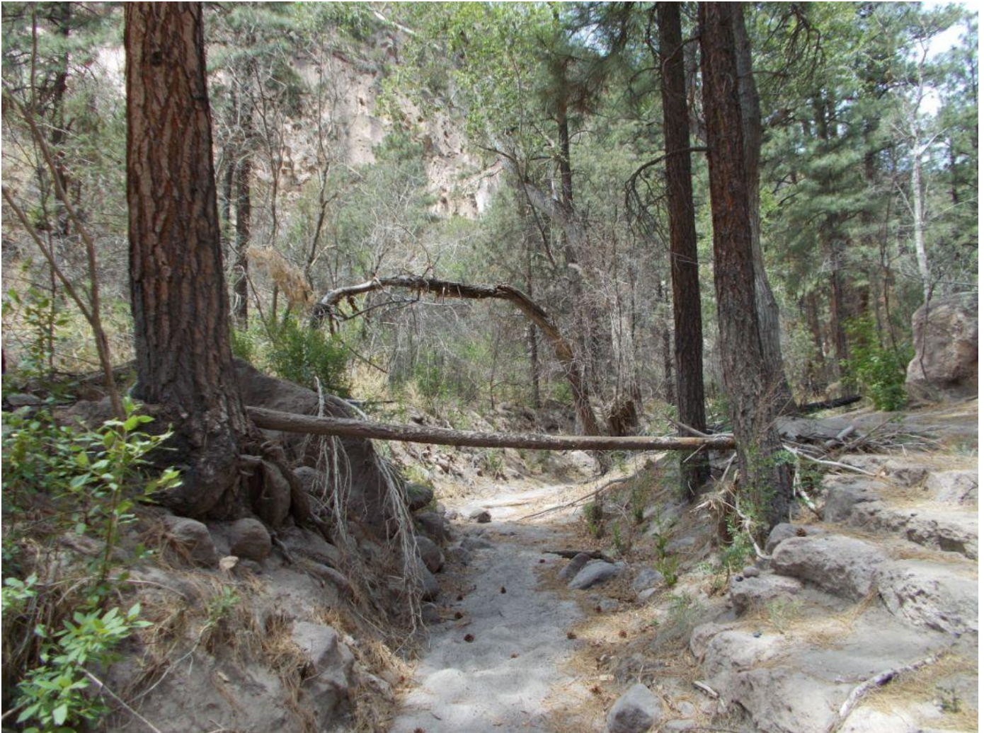
The dry stream bed is the canyon floor. A man-made bridge is still suspending over the dry bed

Before the Alamo canyon, there is small canyon named after Charles F. Lummis. Mr.