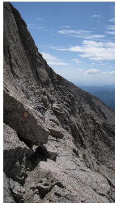
Crossing the Narrows

We were entering the Narrows. As you can imagine from its name, the Narrows is a ledge on the side of the mountain that varies from between one to a few feet wide. It presents the most exposure along the entire trail. This part is notorious for fatal accidents. Just glancing from a few feet away, I thought it was impossible to cross it, as I could barely see a path, only people moving around gingerly on the wall of the mountain. I didn’t know where they were setting their feet. However, if I focused only on my next step, I figured that I could always find a spot to move forward. It was the exposure which was the hardest part to deal with, harder than actually moving my feet forward. If I misplaced my foot, it was more than a thousand-foot drop on the right side. Just thinking of this possibility made me tremble. I didn’t have a chance to