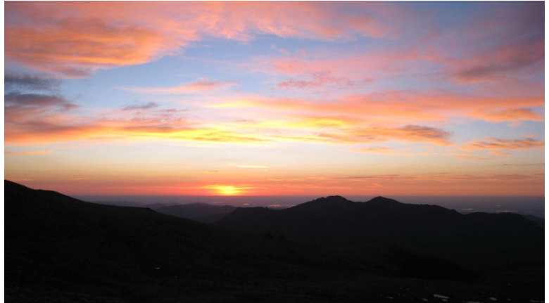
Witnessing the beautiful sunrise

Hiking in darkness wasn't much fun. Nothing could be seen but the snake of lights spreading out all the way ahead, and the full moon in the sky. Occasionally some people passed me. I tried to push the thoughts of tiredness out of my head, but I had nothing else to think about. I could hear my own heavy breathing. I felt my heart was pounding so hard. I was pulling my left foot in front of my right, then the right foot in front