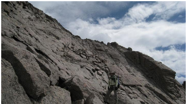
Winnie at the bottom of the Homestretch

The last section was called the Homestretch, a sheer 300-foot path up to the summit. When I was doing research on the trail on the Internet, I copied a photo of it from some website, and posted it on my Facebook page, stating that if I could take a photo of it myself, I would get myself a nice gift.