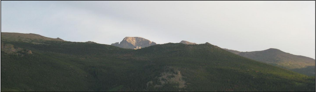
View of Longs Peak from our campsite

Longs Peak is the highest peak in Rocky Mountain National Park, at 14,259 feet. It is the 15 th highest peak in the state of Colorado. The Keyhole route to the summit has five major sections: