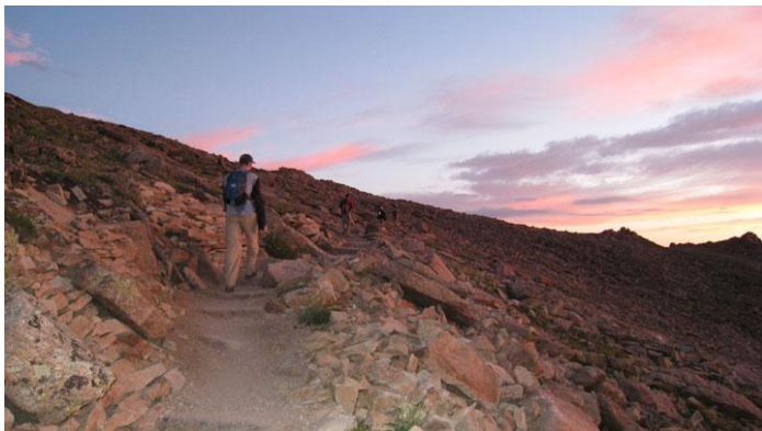
Young people passed by me

of the left, repeating it over, and over again, endlessly. The only way I could check the distance I had gone was by my watch. After about 45 minutes had passed, I started hearing the sound of a brook. I knew that I was passing Alpine Brook. It was followed by a wooden bridge which matched the description I had read about. A little more time passed, and we were marching above the timberline. Gradually, a strip of orange light appeared from the East; it was the start of a new day. For the first time hiking at above 10,000 feet, I felt that I was so close to the sun. I turned off my headlamp. It was getting brighter and brighter. I enjoyed every second of the changes, taking pictures, and momentarily forgetting the tiredness.