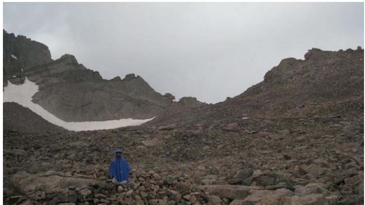
My last picture of Keyhole as well as my last photo of the hike

My first goal was getting back to the Keyhole, then passing the Boulderfield. I knew after that, I would only have to deal with fatigue without any risk to my life. However, the intervals felt like forever. I felt my energy level was almost zero. I picked up my hiking poles at the Keyhole. When we reached the Boulderfield, the boulders were all wet from the rain and hail, which increased the danger. Our backpackers picked up their backpacks at the