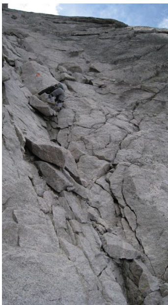
Cherry was climbing the Trough

From the Keyhole, we only had one mile to the peak. The hands of my watch pointed to 8:36 when we continued from the Keyhole at 13,150 feet. Following the red and yellow dot bull’s eyes, we turned left and scrambled south onto the marked path, which is called the Ledges. The route climbs up before descending 100 feet. It took us another hour to reach the bottom of the Trough, near 13,300 feet. We took another break and had a little snack.