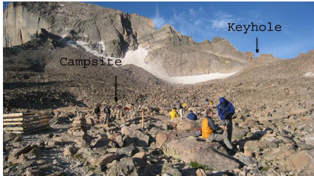
The Boulderfield Campsite

At this point, I knew that I had almost finished the first six miles and was getting closer to the peak, but didn't realize that the real challenges had just started.