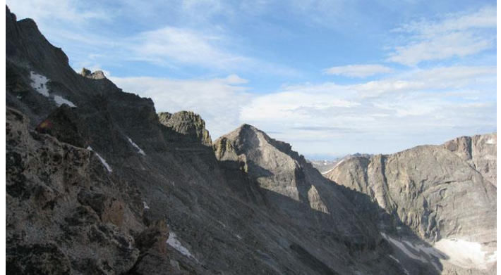
The back of the mountains behind the Keyhole

The moment I reached the top of the Keyhole, where I could see the back of the mountains, I saw that they dropped thousands of feet down. I felt as if I were standing on the top edge of a highrise building. My legs started trembling. I saw a narrow path marked with bull's eye blazes which we had to follow. A few spots where one could sit had been occupied by the people who arrived earlier. They looked as if they had taken some bar stools up to a spot at 13,150 feet elevation and were sitting in the middle of nowhere. The Keyhole seemed to be their final goal, so they were relaxing and enjoying the spectacular views in the sky.